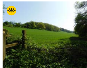
View across Preston Valley